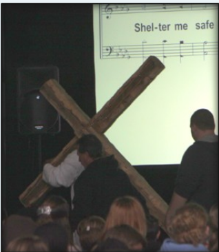
The cross of Christ Is lifted high both literally and symbolically.

For our teens, the two most important events each year are Winterfest in February and Stand Your Ground in October. About twenty of our teens attended the Stand Your Ground (SYG) annual retreat at Camp Manatwny a week ago. This year's retreat, hosted by the Freehold and New Brunswick churches of Christ, was entitled, Counterfeit Christianity Unmasked . The theme verse was 1 Timothy 4:12: "Don't let anyone look down on you because you are young, but set an example for the believers in speech, in life, in love, in faith and in purity."