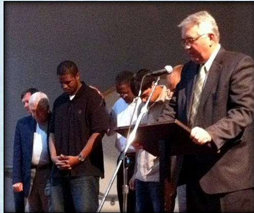
Above: Our elders pray for us in public, but they also prayed for us last weekend during their retreat.

The eight plus hours we spent working there was valuable time for several reasons: team building, reaffirmation of our love and respect for one another (allelon!), dreaming of the future, shepherding concerns, praying for one another (allelon!) and numerous people [We prayed for all seventy of the names that you submitted a month ago after the sermon on "dry bones."]; situations, and decisions. And, yes, some eating and laughing together (allelon!).